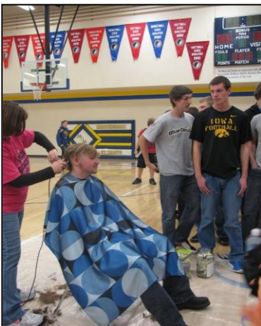
from Dec. 14 th “Cuts for Cody” Fundraiser